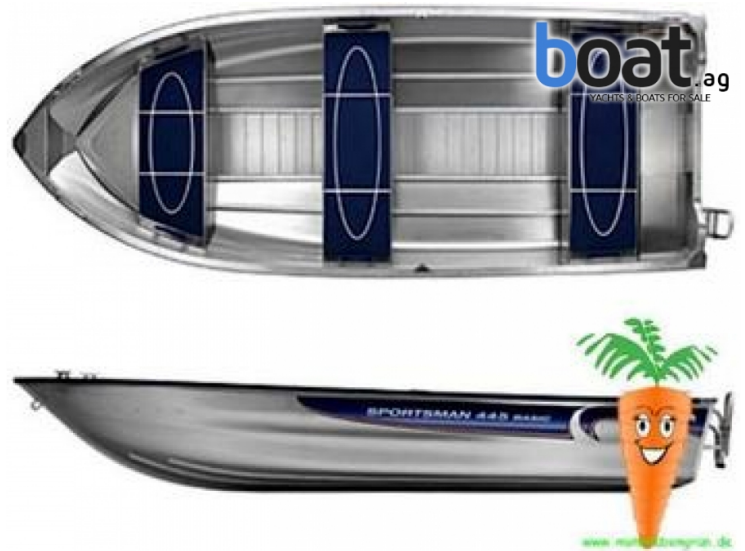
Outside view - Image 2