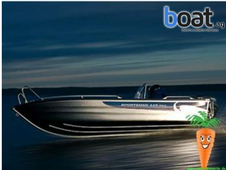
Outside view - Image 1