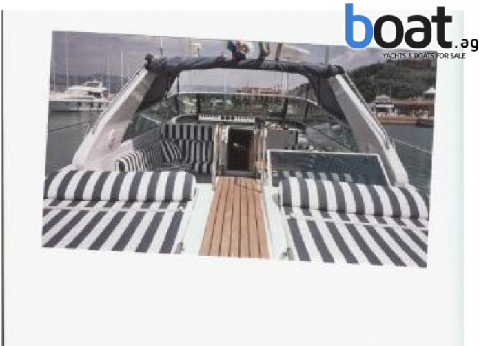
Outside view - Image 3