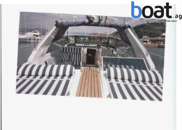
Outside view - Image 3