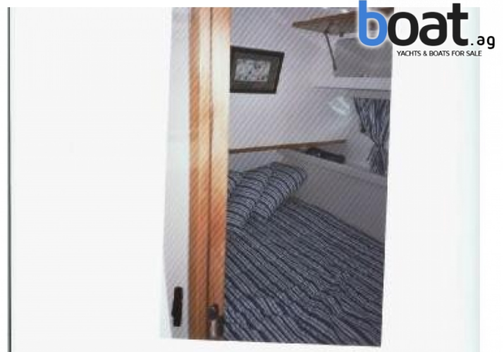
Outside view - Image 2