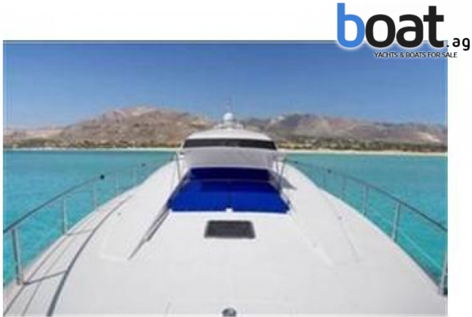
Outside view - Image 1