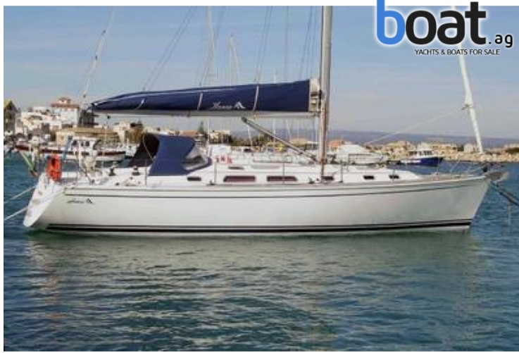
Esterni - Foto 1