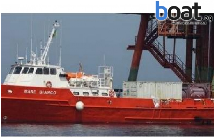
Outside view - Image 1