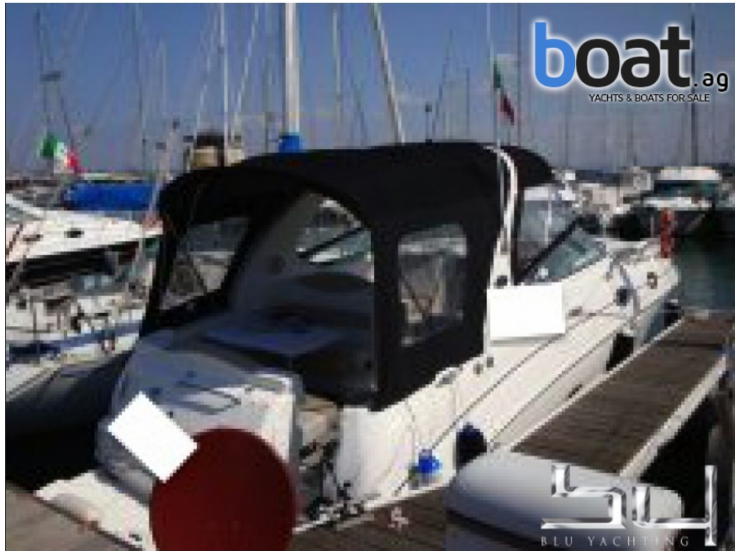
vanjski izgled - slika 1