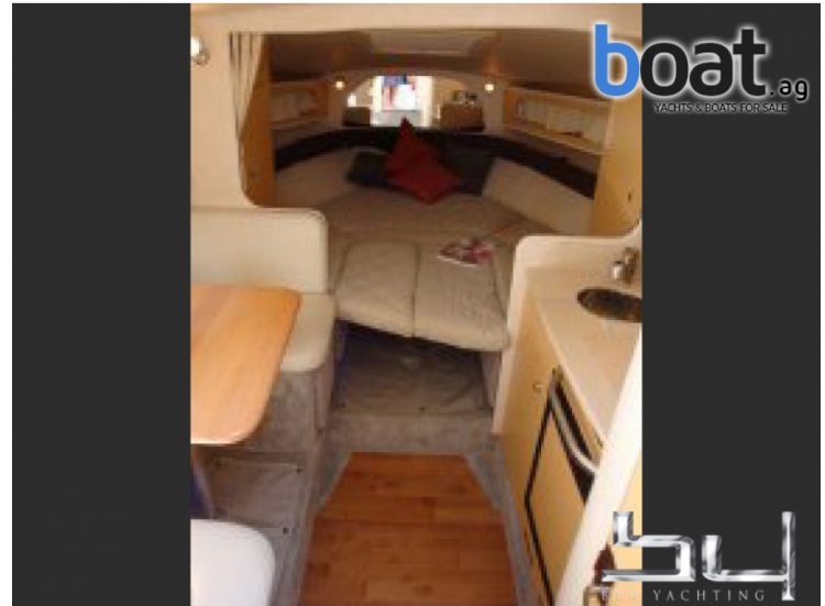
unjutrarnji izgled - slika 2