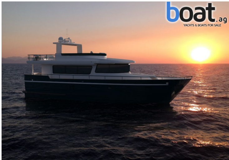
Outside view - Image 3