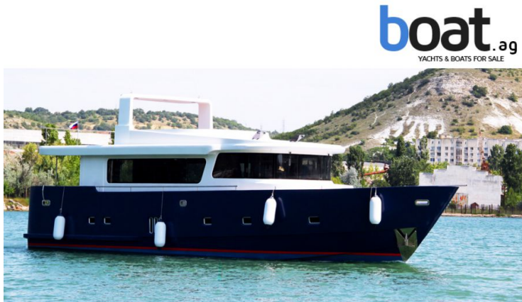
Outside view - Image 1