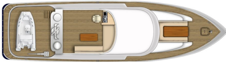
Inside view - Image 9