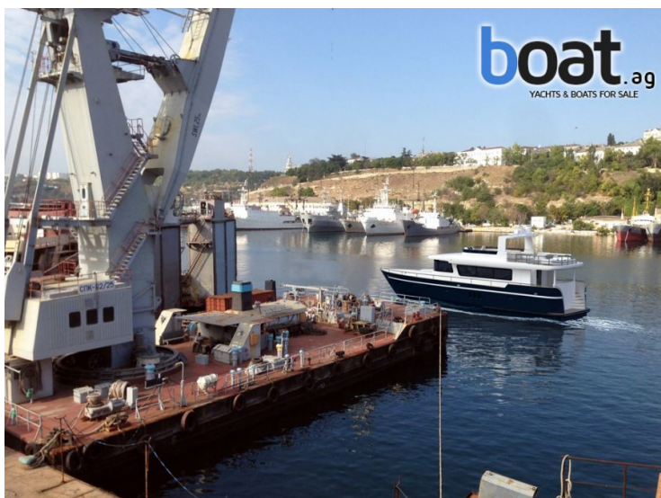
Outside view - Image 5