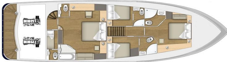
Inside view - Image 7