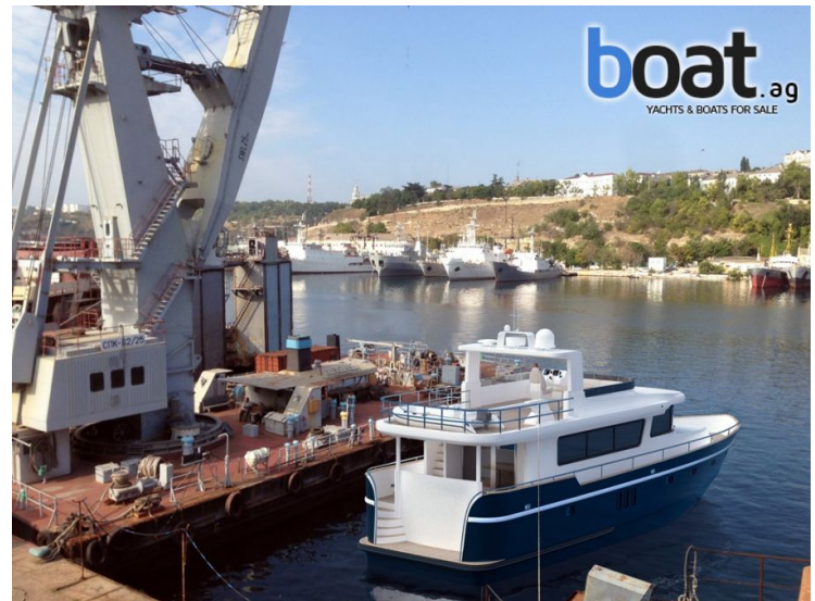
Outside view - Image 4