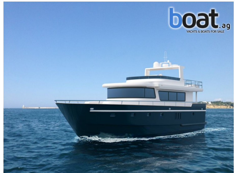
Outside view - Image 2