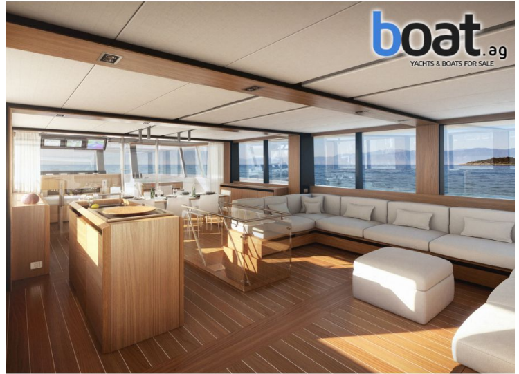
Salon - Image 8