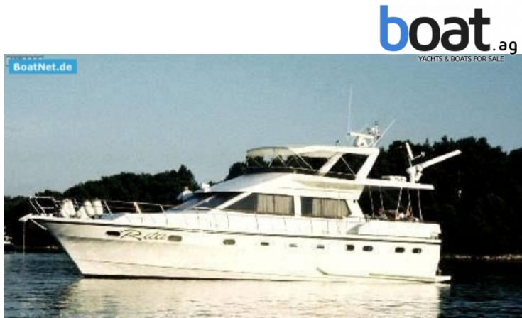
Outside view - Image 1