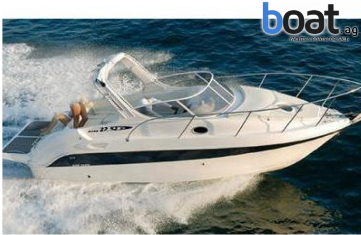
Outside view - Image 1