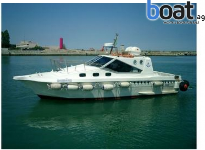
Outside view - Image 1